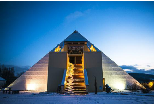
The main pyramid in winter time